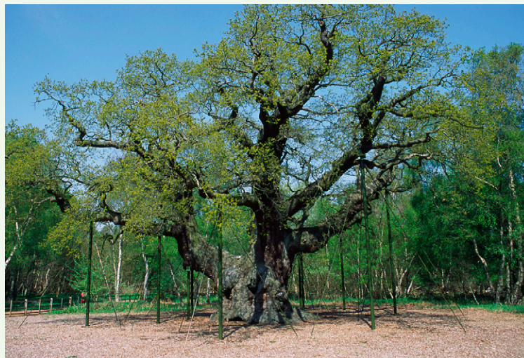
Ancient: Researchers are keen to restore Sherwood Forest as the ancient oaks, reaching the end of their life, provide a key habitat.