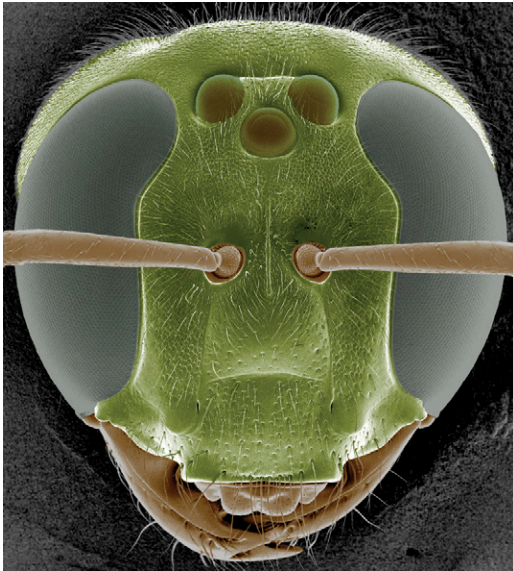
Figure 1. The head of the nocturnal bee Megalopta genalis , showing the relatively large compound eyes and ocelli.